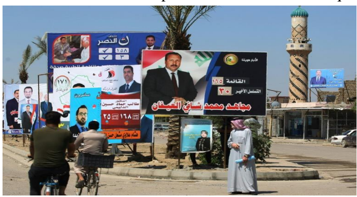
Figure (12): The random advertisements for politicians on one of the squares.