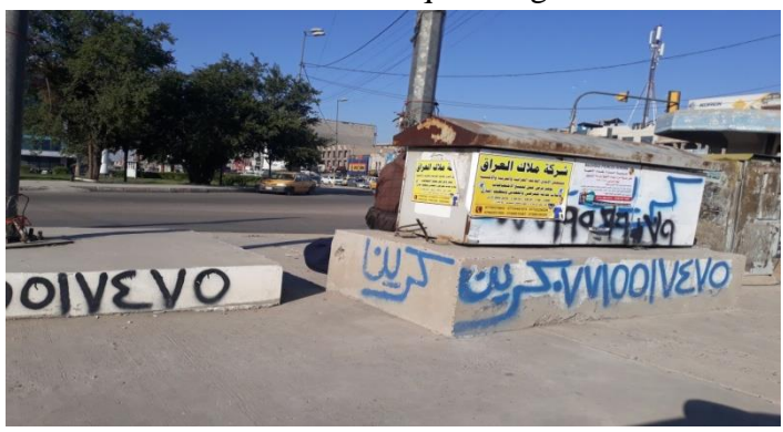
Figure (16): Random advertisements in adin square on the electrical board.