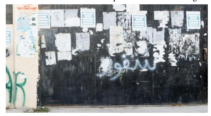
Figure (9): The random advertisements on walls.