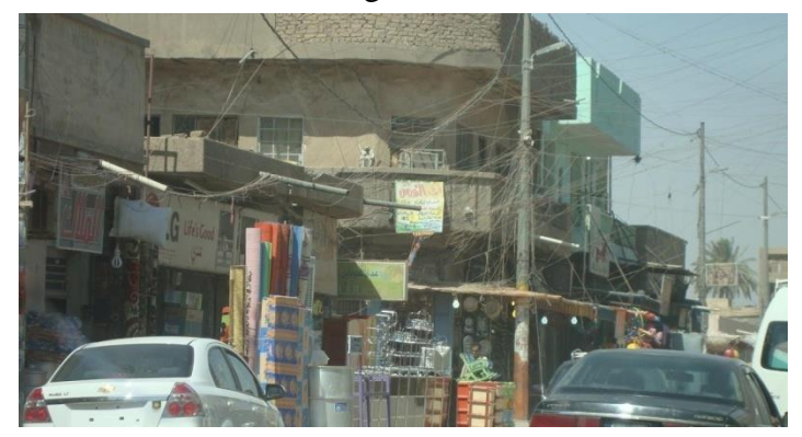
Figure (2): Random distribution of electrical generator wires and significance for places.