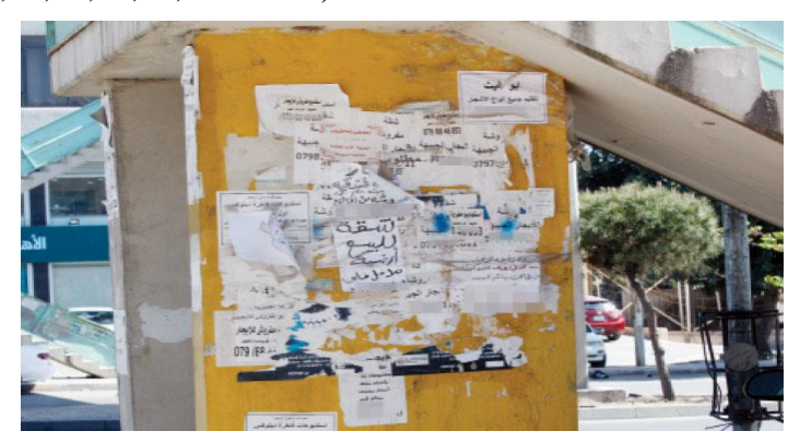
Figure (5): Random advertisements in the street.

Random advertising is we see on the walls to indicate a particular subject, columns of electricity, or sideways, and finally campaign advertisinghave been added see in (Figure 5, 6, 7, 8, 9, 10, 11, 12, 13, 14, 15 and 16).