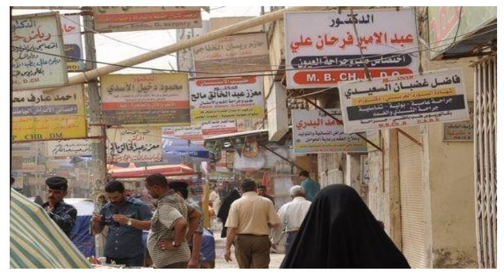
Figure (3): random advertisements significance for doctors