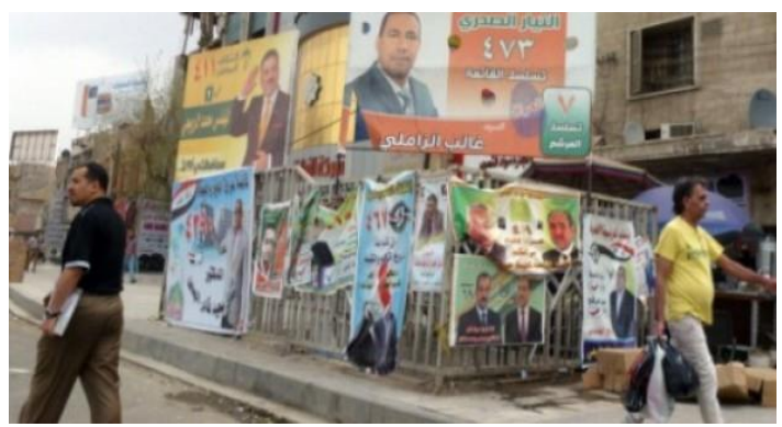
Figure (10): The random advertisements for politicians.