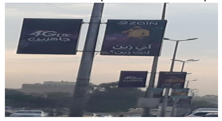
Figure (13): The random advertisements in al-jadiryia bridge.