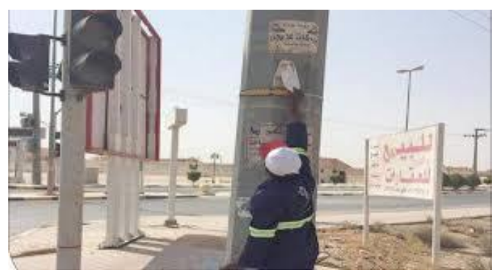
Figure (7): advertisements that are affixed to the posts of the electric lights.