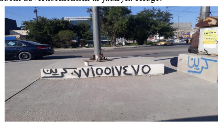
Figure (14): Random advertisements in adin square.