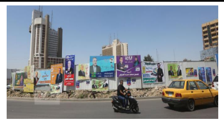
Figure (11): The random advertisements for politicians on al-ferdows square.