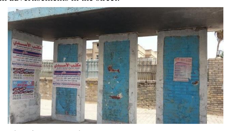
Figure (6):Random advertisements at bus stops.