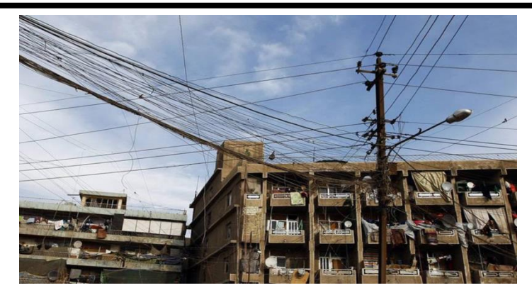
Figure (1):Random distribution of electrical generator wires.