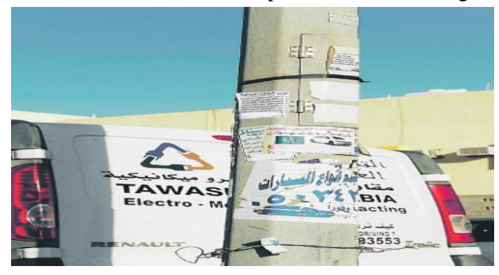
Figure (8): advertisements that are affixed to the posts of the electric lights.