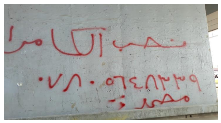
Figure (15): Random advertisements down al-liqua bridge.