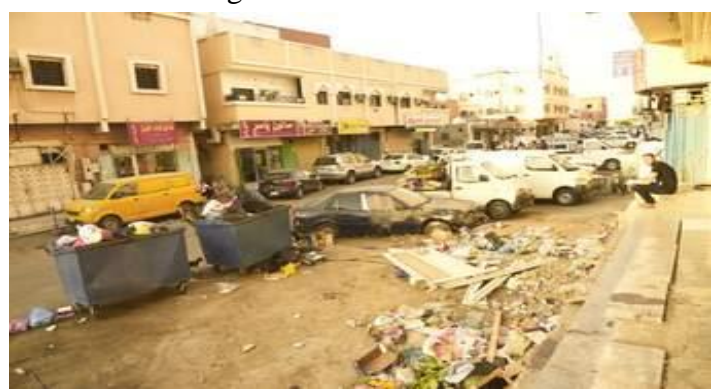
Figure (4): Random trash in the street.