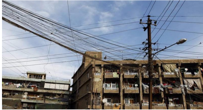
Figure (1): Random distribution of electrical generator wires.