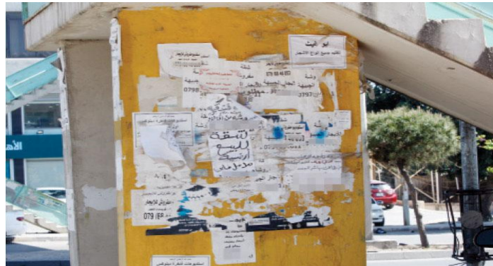
Figure (5): Random advertisements in the street.

Random advertising is we see on the walls to indicate a particular subject, columns of electricity, or sideways, and finally campaign advertisinghave been added see in (Figure5,6,7,8,9,10,11,12,13,14,15 and 16).