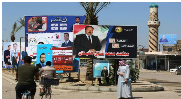
Figure (12): The random advertisements for politicians on one of the squares.