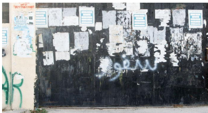
Figure (9):The random advertisements on walls.