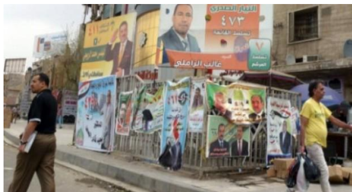
Figure (10): The random advertisements for politicians.