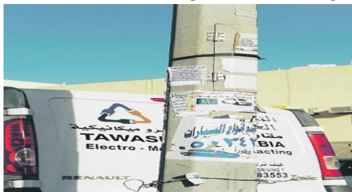
Figure (8): advertisements that are affixed to the posts of the electric lights.