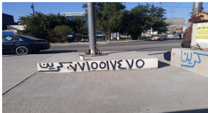
Figure (14): Random advertisements in adin square.