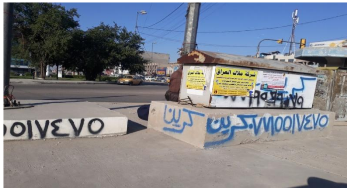
Figure (16): Random advertisements in adin square on the electrical board.