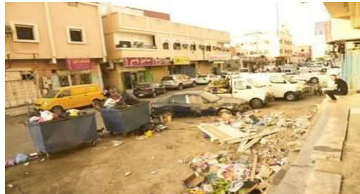
Figure (4): Random trash in the street.