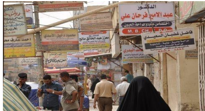
Figure (3): random advertisements significance for doctors