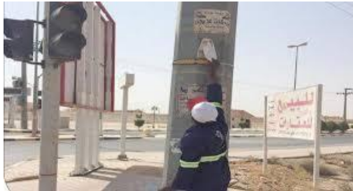
Figure (7): advertisements that are affixed to the posts of the electric lights.