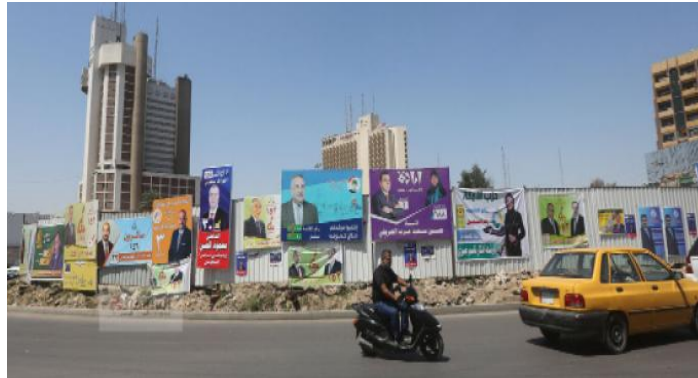
Figure (11): The random advertisements for politicians on al-ferdows square.