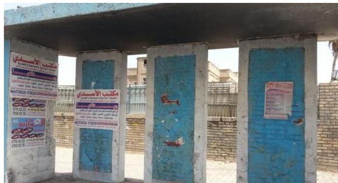
Figure (6):Random advertisements at bus stops.