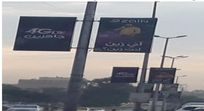
Figure (13): The random advertisements in al-jadiryia bridge.