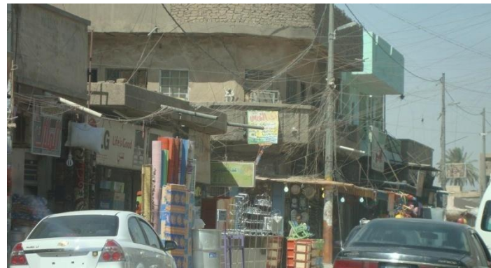
Figure (2): Random distribution of electrical generator wires and significance for places.