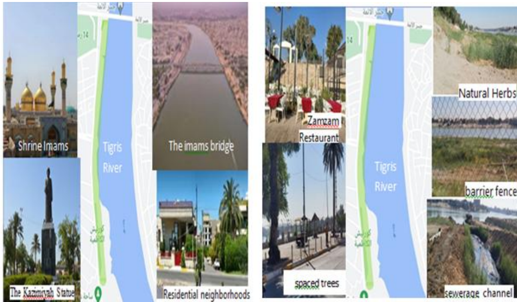
Figure (2 –A): The most important landmarks surrounding the site, Figure (2-B): some components the site, The researcher based on (Google, 2021).

The functional and religious significance of the city cannot be ignored, as it is the reason for the development of urban activities, especially residential use. The location is bounded by the Imam Bridge to the north, the Tigris River to the east, residential areas in Al-Kadhimiya to the west, and it is bordered to the south by a square and the statue of the renowned poet Abdul Mohsin Al-Kadhimi. The shape of the site is that of a narrow strip connecting the river to the adjacent residential areas Figure (1). The Corniche is situated in the 413th neighborhood, with a length of 1300 meters and an average width of 20 meters, resulting in an area of 2000 square meters. The Corniche begins from the area adjacent to Imam's Bridge and extends to Abd al-Muhsin al-Kadhimi Square Figure (1-B). The Corniche takes the shape of a triangle, widening at its center and narrowing towards its ends. A slight curve is evident along the riverbank within the study area. The land is flat, and the riverbank has a steep elevation from the part close to the water to a higher area on the edge. There is an increase in the area of the zone adjacent to the water due to the river's recession in the areas far from the curved region. The site contains a few large trees such as Zizyphus Spina and Phoenix dactylifera , but lacks green spaces along the slightly winding riverbank Figure (2-B).